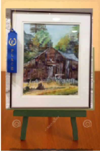
First Place Donna Arrillaga "Old Barn"